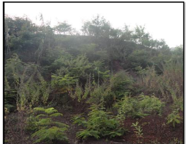
Photo 4A & 4B - Shows Green Coverage on Dumps with application of coir mat & grass seed applications