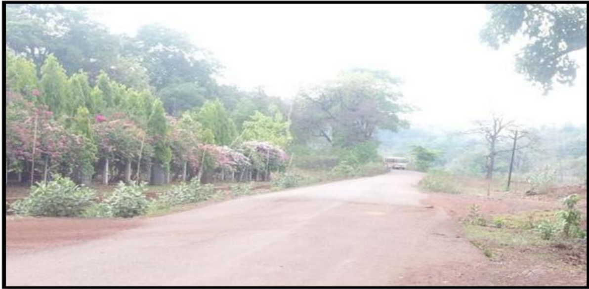
Photo 11 – Showing the black topped road for transportation of minerals