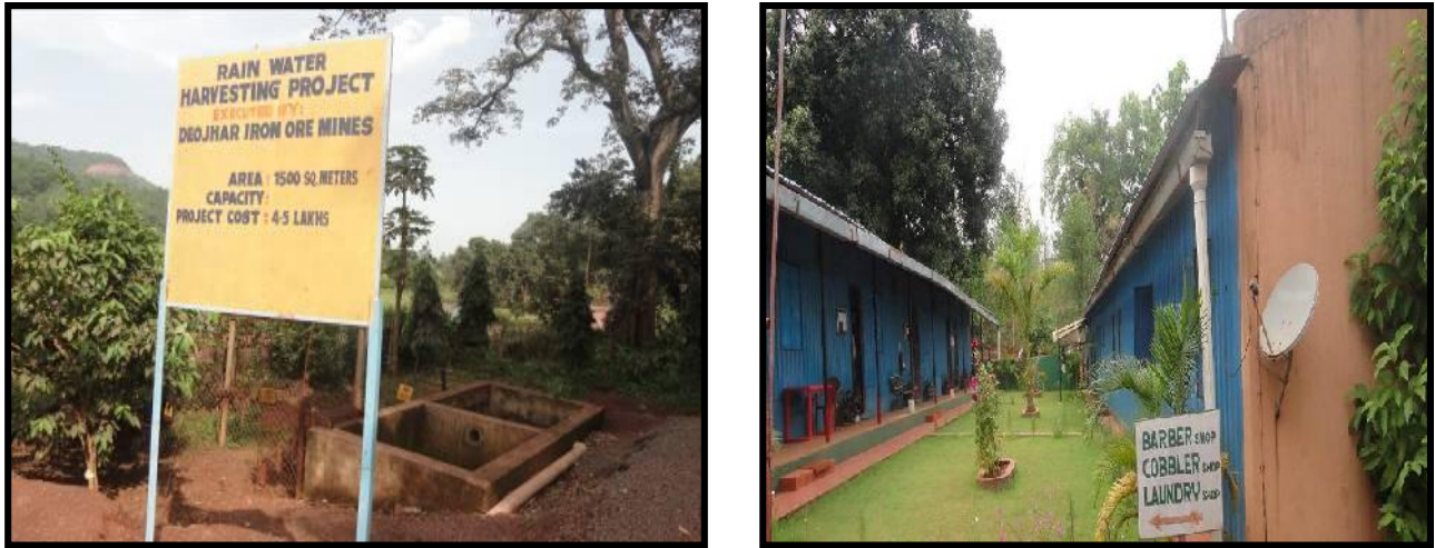
Photo 10 – Shows roof top Rain Water harvesting structure & Recharge Pit